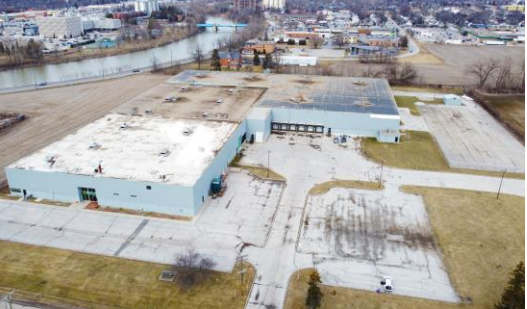
Magna expands in Chatham, producing battery enclosures

to Chatham with new job opportunities working on an exciting new technology that offers a lot of growth potential."